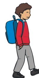
ngā hikoi poto