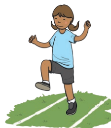
ngā hikoi nui